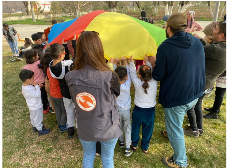
4. PSS Activities, Diyarbakir

STL plans to extend its MHPSS work with multiple mobile teams consisting of 1 psychologist, 2 PSS employees and 1 social worker, in cooperation with the Ministry of Family and Social Services, in the form of community-oriented Psychosocial Support (PSS) and expertise (MH) with reference to the IASC MHPSS intervention pyramid. (For details of the Emergency MHPSS Plan see: STL SitRep No:9 )