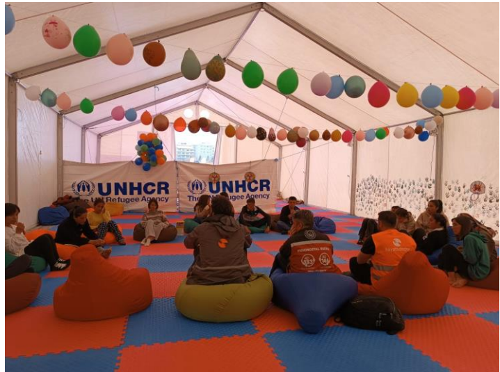
3. STL Youth Solidarity Network, Adiyaman

STL field teams observed that most basic needs are met in Adiyaman Municipality Tent City No. 10, but vulnerable groups such as elderly and people with disabilities have problems, especially in accessing their hygiene needs. There are latrines and shower units in the tent zone, but their condition is not hygienic. In addition, NFIs such as napkins, toilet paper and soap are often not available. The most primary needs in the zone are underwear, slippers, clothes, towels and hygiene kits. People affected by the disaster also stated that they have problems in reaching the social markets in the area.