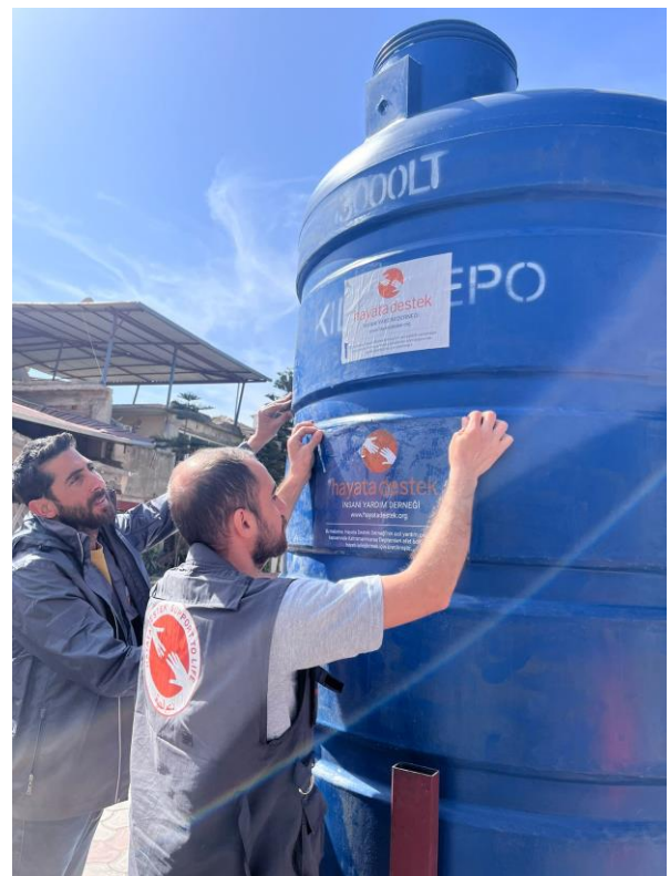
1. Water Tank Installation, Hatay

The WASH needs in rural areas also stands out. Affected households have asked for jerry cans, stove and wood. The need for a stove is not only related to heating but also to hygiene needs as disaster-affected people get their bathing water from well water and they need to heat the water on the stove.