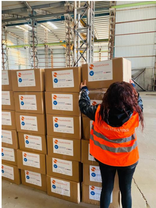
2. Planning of Hygiene Kit Distribution, Adiyaman

The most prominent needs in temporary settlement area are water supply - both for drinking and domestic use – sanitation and hygiene, especially latrines. Access to latrines is very difficult, especially for elderly and people with disabilities. According to the information received from the officials of the Ministry of Family and Social Services, some families started to use diapers again for children aged 5-6 and even older due to a lack of latrine facilities. This puts the well-being of children at risk.